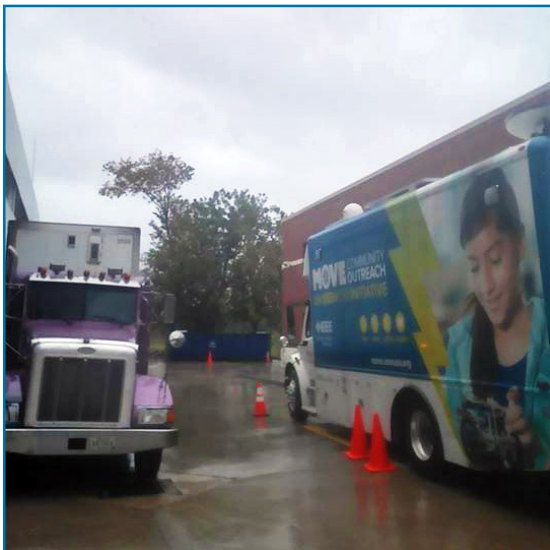
Hurricane Harvey Support - Houston, TX

Within 24 hours of returning from Andrews NC, we had the oil changed in the truck and were headed for Houston Texas to assist with hurricane Harvey. We arrived in an endless downpour that went on for days. Houston got 51 inches of rain in less than 3 days. We slept in the truck and the next day were assigned to the mega shelter at the George R Brown convention center. Little did we know that in the next 48 hours the Red Cross would take in over 10,000 people that required shelter. We assisted the Red Cross with setting up laptops, printers,