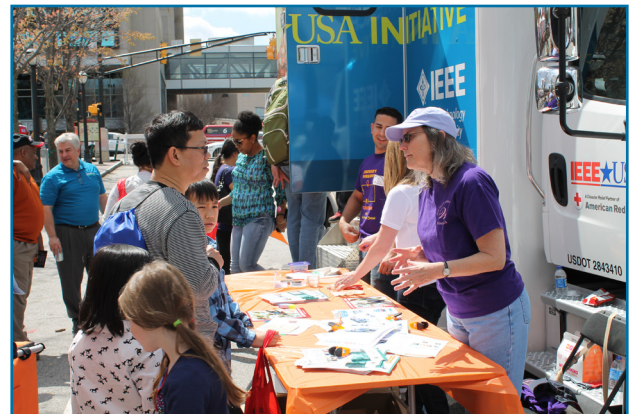
Atlanta Science Festival