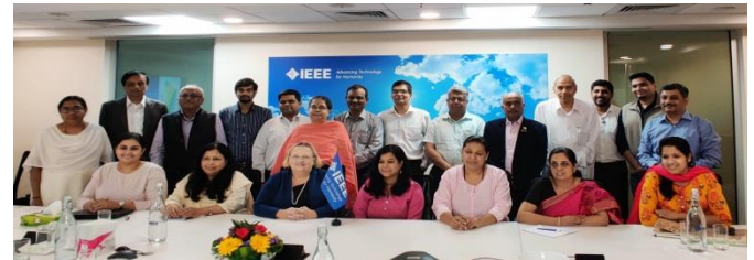
Participants at meeting in Bengaluru, India

Since disasters often cause significant damage to infrastructure on islands, deploying equipment quickly is a challenge. Modular solutions, such as Modular MOVE (discussed in our last newsletter) are also being explored because they are quicker to deploy.