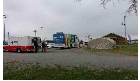
MARC in Lebanon, TN

The team provided Disaster Services Technology support services (technology support, communications/internet access) to help MARCs provide services such as mental health support, WeGo transit passes, preparedness information and disaster health services, financial and insurance assistance, and more.